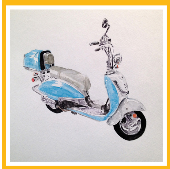
Ilana Crispi, Scooter, Watercolor on Paper